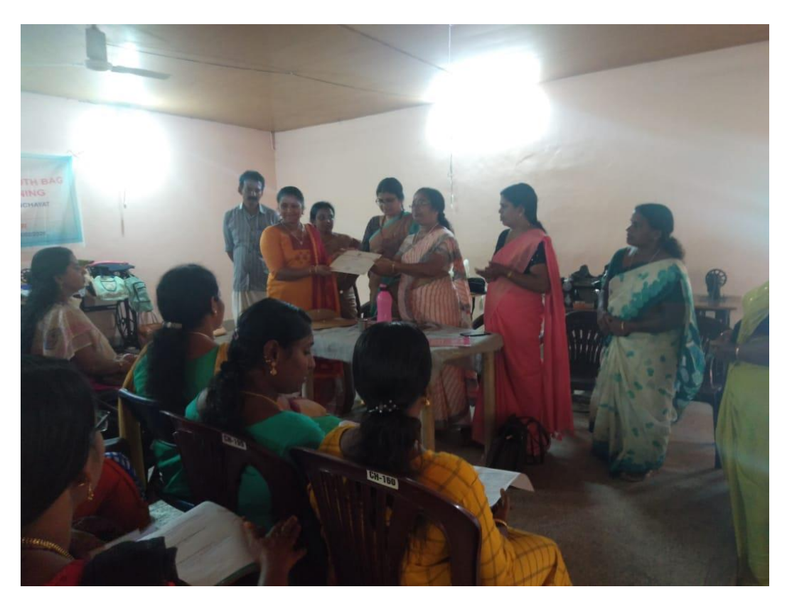
Certificate Distribution- Cloth Bag Making