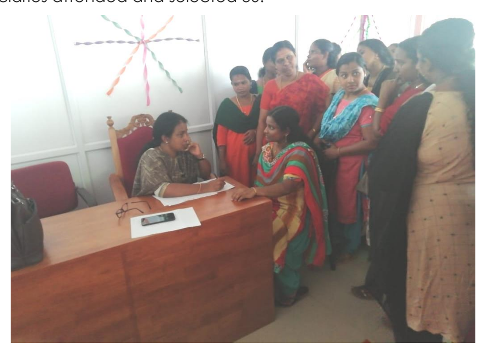
Interview - Cloth Bag Making

For the selection of beneficiaries an interview conducted on 18.01.2020 at Arimpur Panchayat Conference Hall, Thrisuur with the presence of Arimpur Panchayat Welfare standing Committee Chairperson. Total 40 beneficiaries attended and selected 30.